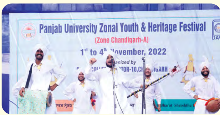
Folk Dance - Second in PU Zonal Youth & Heritage Festival 2022-23