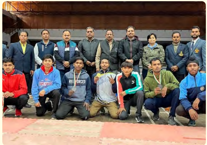
Winners of Panjab University Wushu Championship