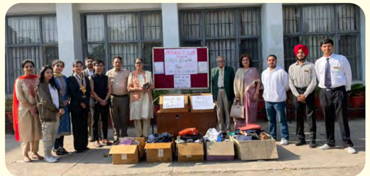
Donation Drive for needy people and adopted animals organised by SGGS Rotaract Club