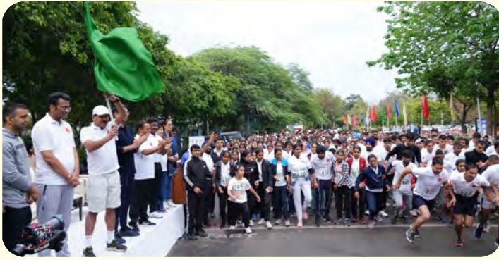
Volunteers in Marathon for LIFE- Lifestyle for Environment, by EIACP, Department of Environment, Chd Administration