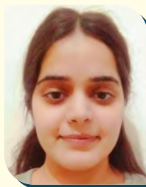
INDU MSc Physics, CSIR-UGC-NET Jun 2022