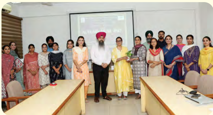
Autumn Muse-2022 Sep 02, 2022

The Literary Competition was conducted in six categories including Debate, Elocution, Poetry Recitation, Poetry Writing, Essay and Short Story Writing. The event witnessed an overwhelming participation from 94 students. The winners were awarded certificates.