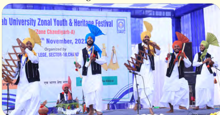
Folk Orchestra - Third in PU Zonal Youth & Heritage Festival 2022-23