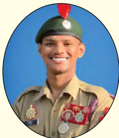
AJIT BA II