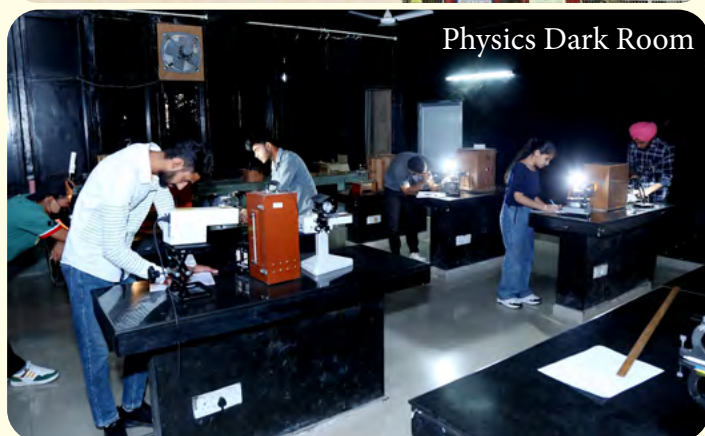
Physics Dark Room