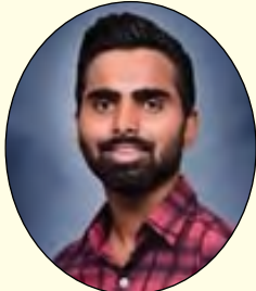
PRINCE BA III