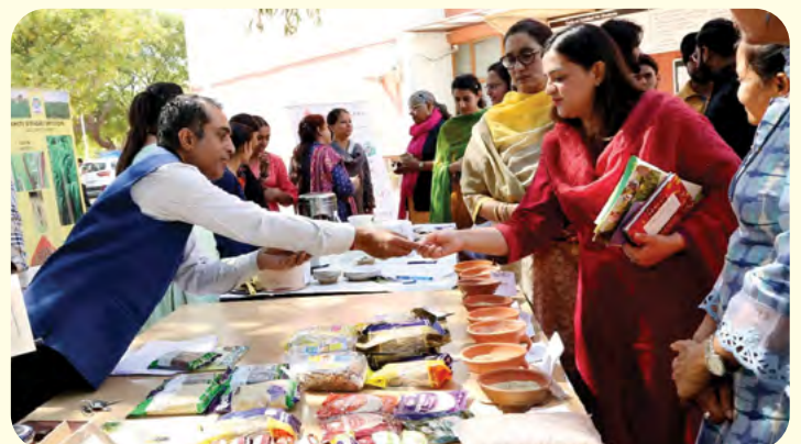
Stalls of Phulkari, Manure Mart, Jaggery Junction, Handicraft Hub & Millet Meals at Campus Bazaar to promote Entrepreneurship & support Student Self-Help Groups