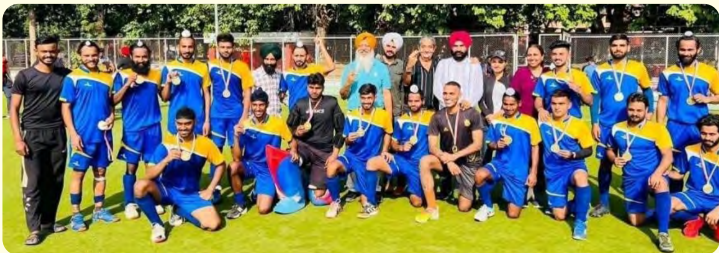
Winners of Panjab University Inter-College Hockey Championship