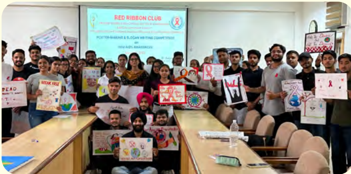
Poster Making & Slogan Writing Competition on HIV/AIDS Awareness